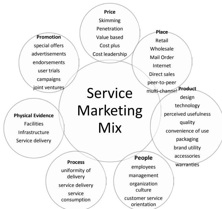
Figure (2.1) The 7 Ps of Services Marketing